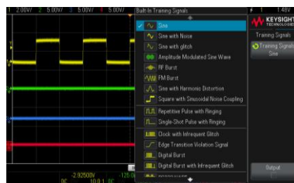
Built-in help and training signals