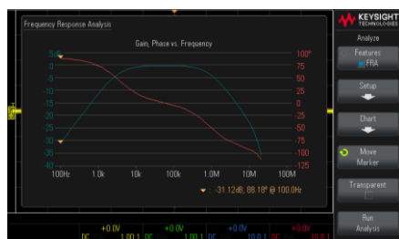
Bode plot feature for frequency response analysis

The 1000 X-Series leverages the same, proven technology we use in our higher-end InfiniiVision family, giving you professional-level measurements you can trust. Now you can get even more functionality with capabilities like 4-wire SPI decode and remote connection via LAN. Get the performance you need to measure with confidence.