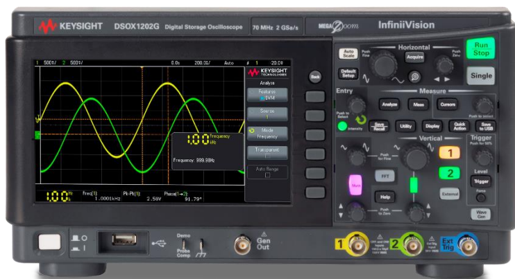
2 Channels: EDUX1052A; EDUX1052G; DSOX1202A; DSOX1202G