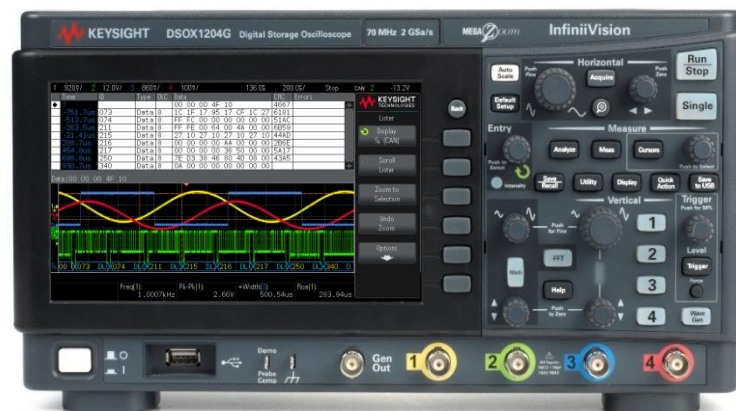
4 Channels: DSOX1204A; DSOX1204G